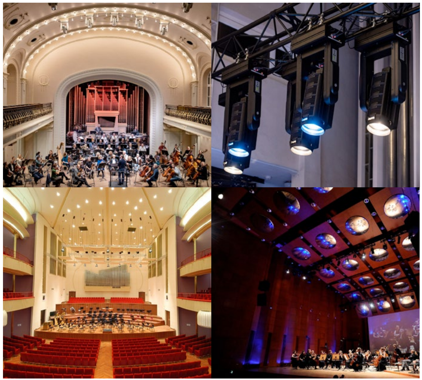
Professional lighting for the performing arts since 1969